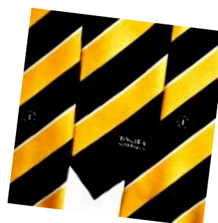
Dress Tie $32.50