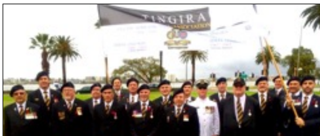
"On The March...Tingira Boys" - Melbourne, Brisbane, Adelaide and Perth band together for ANZAC Day 2016,