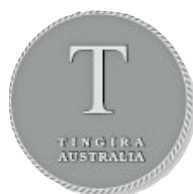
Foundation Membership $200