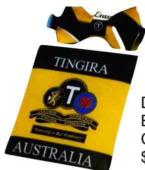
Dinner Set... Bow Tie & Cummerbund $100