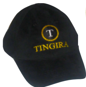
Baseball Caps $32.50

Size... S to 5x Members - Associates and friends