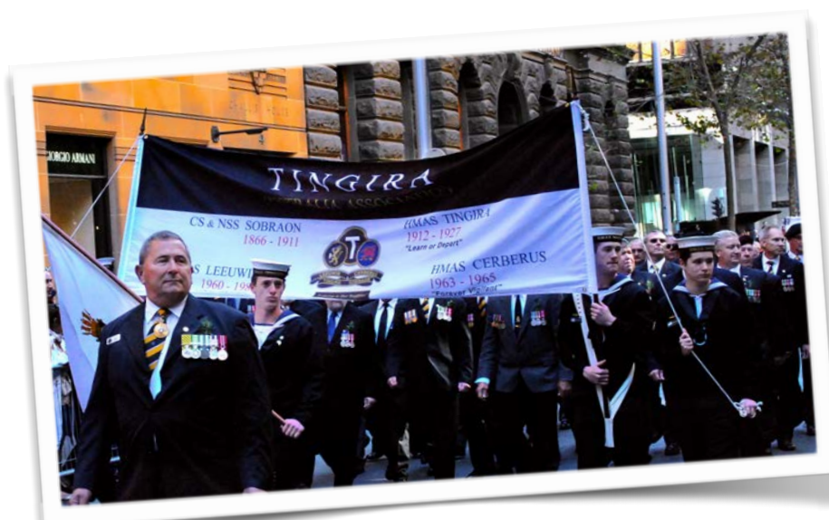
ANZAC DAY - SYDNEY - 2012