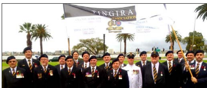
"On The March...Tingira Boys" - Melbourne, Brisbane, Adelaide and Perth band together for ANZAC Day 2016,