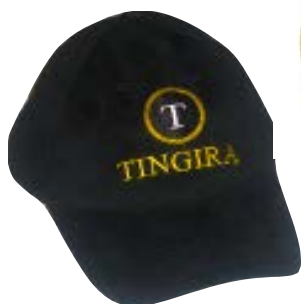
Baseball Caps $32.50

Size... S to 5x Members - Associates and friends