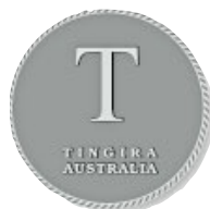
Foundation Membership $200