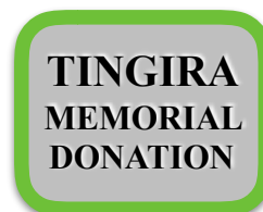
2018 Upgrade Fund