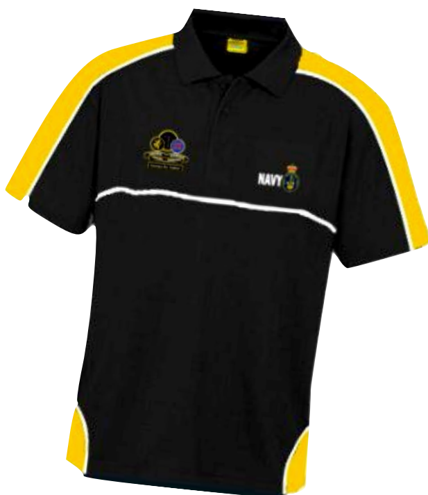
Polo Shirt $42.50