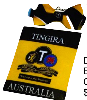
Dinner Set... Bow Tie & Cummerbund $100