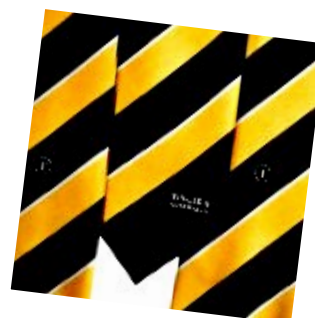
Dress Tie $32.50