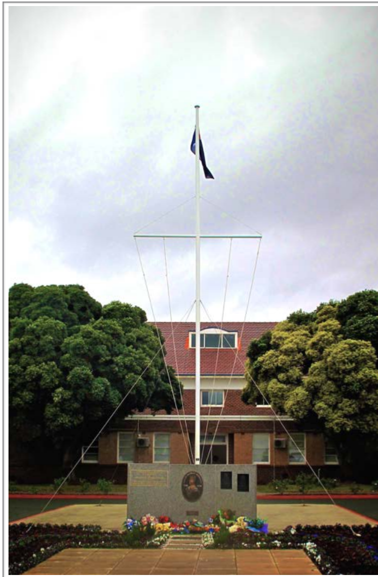
JR Memorial - Leeuwin Barracks, East Fremantle, WA