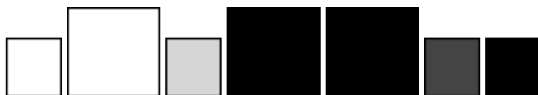
Greyscale Mono Reverse

Use the greyscale or mono versions of the logo where colour reproduction is not available.