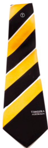
TINGIRA TIE $32.50

Sizes: Small to 5x Members, JR's, Associates & friends of Tingira