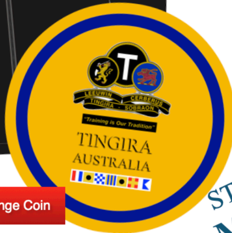
Reunion Challenge Coin