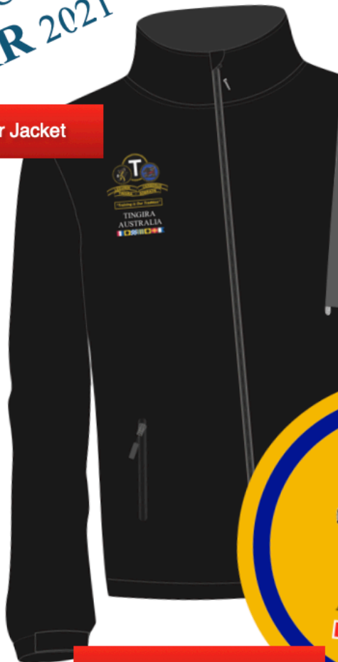
Foul Weather Jacket