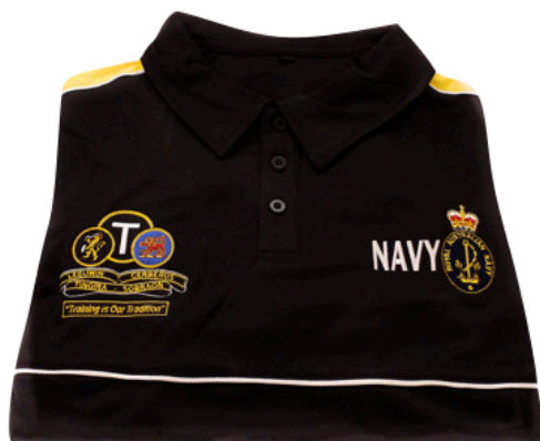
TINGIRA POLO SHIRT $42.50