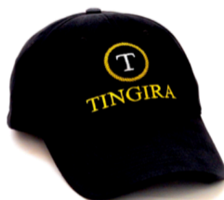
TINGIRA CAP $32.50