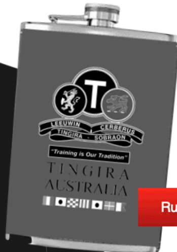
Rum Hip Flask