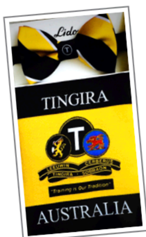
TINGIRA DRESS BOW TIE CUMMERBUND $100